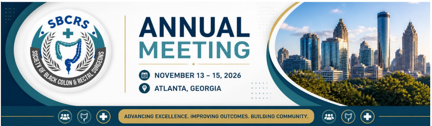
EXHIBIT OPPORTUNITY LEVELS